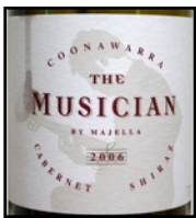
“The Musician” by Majella Cabernet-Shiraz Coonawarra 2006

Rich Ruby color. Nose shows peppery, earthy aromas with notes of blackberry jam. Bright acidity hits the palate, with roasted plum and meaty flavors coming through to the fine tannins on the finish. This moderately-bodied wine has no apparent oak, is done in a very dry style and is quite food friendly. Interesting to drink. $23.