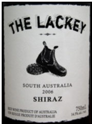
“The Lackey” Shiraz South Australia 2006 by Kilikanoon Wines

Even though prices always seem to be rising, there are still good Aussie values available in the marketplace today. The wines below offer excellent value for their price point. R.S.