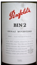
Penfolds Bin 2 Shiraz Mourvedre 2007

Deep Garnet color. Nose shows Dark Chocolate, Plum, and a whiff of pepper. Slightly meaty and savory in the mouth, flavors of ripe black fruit and chocolate abound. An interesting wine with lots going on, showing licorice and a bit of tannin on the finish. Good weight, good balance, and great flavors. Hard to believe it’s only $20.