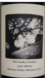
The Lucky Country Barossa Valley/McLaren Vale Shiraz 2007

Bright ruby color. Has an exciting nose of fresh flowers and spice, with ripe red berries. Medium to full bodied with really nice texture – not over done at all. Offers good balance and has food friendly acidity. Finishes with nice length. Very tasty and very well done structurally. Great value at $23.