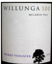
Willunga 100 Shiraz/Viognier McLaren Vale 2006

Dark ruby color. Wonderfully clean nose offers earthy, spicy plum and meaty scents. Medium bodied and extremely harmonious. Very refreshing on the palate, finishes with slightly dusty tannins and good length. A classy wine that shows great refinement and terroir. Classic Coonawarra. A lot of wine for $25.